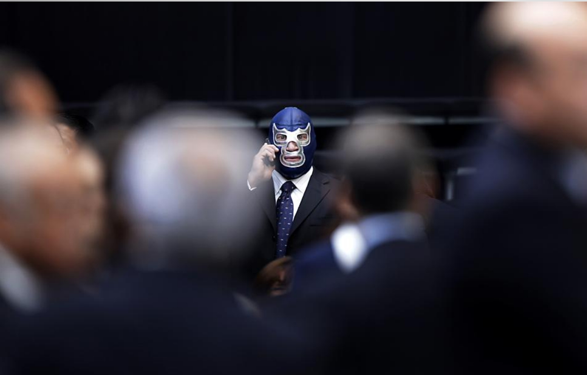
Blue Demon Jr arrives at the National Assembly Hall for President Calderon's State of the Nation address in Mexico City.

The sons of Santo and Blue Demon appeared with Mil Mascaras in the film "Mil Mascaras vs. the Aztec Mummy" in 2007.